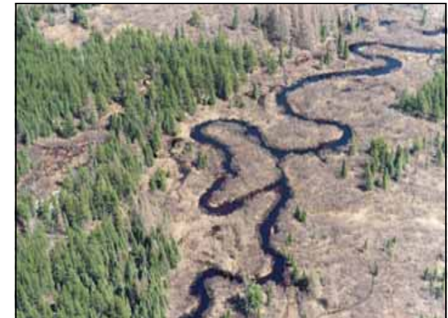
The "Heart" of the matter is Clean Water. Aerial photo of the Yellow Dog Watershed by Chauncey Moran.